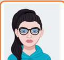
My profile picture