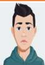
My profile picture