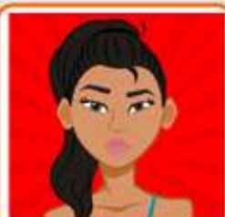
My profile picture