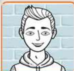
My profile picture