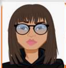
My profile picture