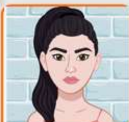
My profile picture