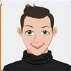
My profile picture