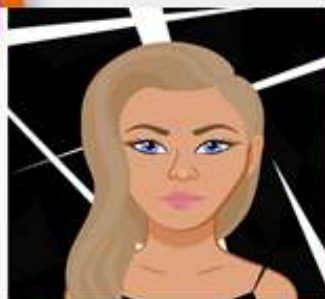
My profile picture