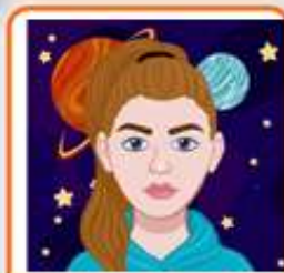
My profile picture