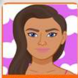
My profile picture