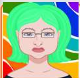
My profile picture