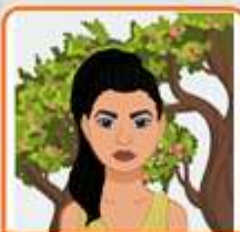
My profile picture