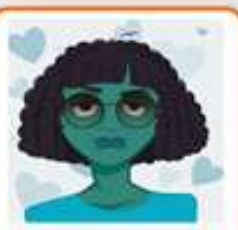
My profile picture