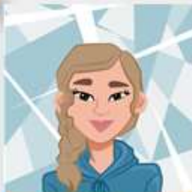
My profile picture