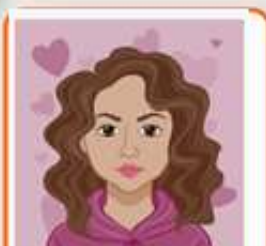
My profile picture