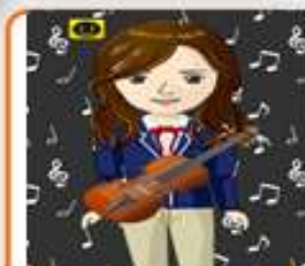
My profile picture