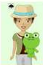
My profile picture