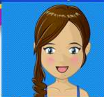
My profile picture