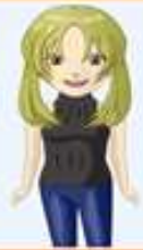
My profile picture