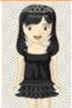
My profile picture